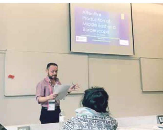
European International Studies Association, Prague, 13 September 2018