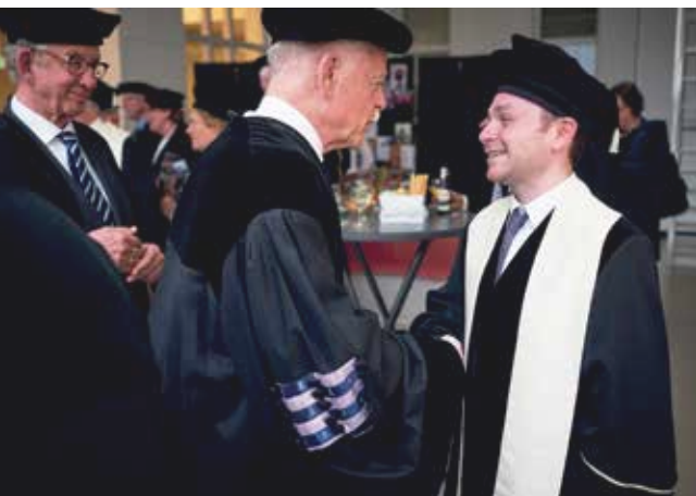
Inaugural lecture Prince Claus Chair, the Hague, 12 April 2018