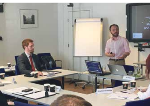
Clingendael Institute, the Hague, 3 July 2018