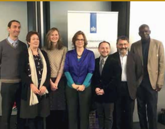
Ministry of Foreign Affairs, the Hague, 5 April 2018