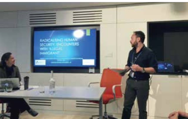
British International Studies Association, Annual Conference, Bath, 14 June 2018