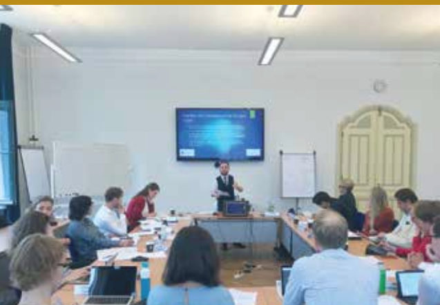
Clingendael Institute, the Hague, 30 May 2018